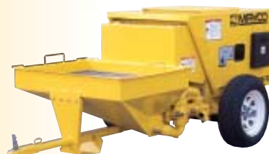
Plaster & Fireproofing Pump