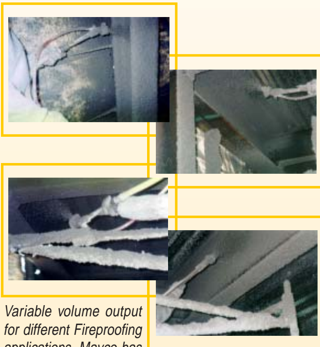
Variable volume output for different Fireproofing applications. Mayco has the right pump for your job.