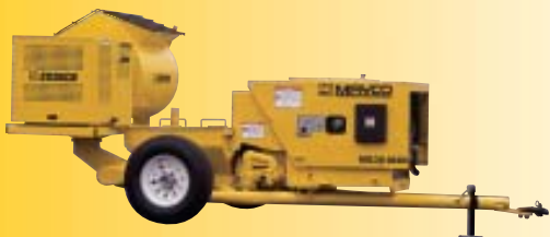
Plaster & Fireproofing Pump with Mixer