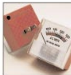
Line Voltage Monitor