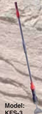
Model: KFS-3 Floor Scraper