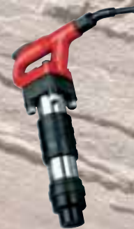
Models: KCB-2, KCB-3, KCB-4