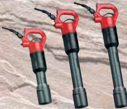
Models: K600, K800 and K1100 Heavy chipping and breaking of concrete, bridgework applications, rivet and bolt head cutting and concrete scaling.