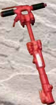
Model 17RT Long handle allows for easy trenching applications.