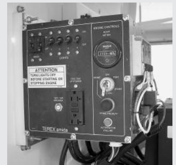
Extra receptacle package available on 20 kW upgrade only.